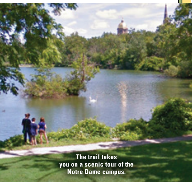
The trail takes you on a scenic tour of the Notre Dame campus.

Indiana trail officials hope to complete the connecting trail to South Bend (on the same abandoned rail bed) within the next three years. In the meantime, you can connect to the South Bend Riverside Trail on Darden Road or the Lasalle Big Blue Stem Trail at Cleveland Road by riding south on Kenilworth Road. The entire South Bend and Mishawaka trail system currently consists of over 35 miles of paved multi-use paths and dedicated bike lines. Its a fun way to spend a day exploring a land called Michiana.