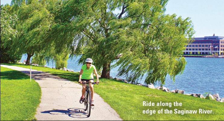
Ride along the edge of the Saginaw River.