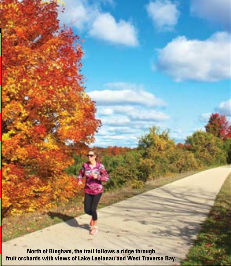
North of Bingham, the trail follows a ridge through fruit orchards with views of Lake Leelanau and West Traverse Bay.