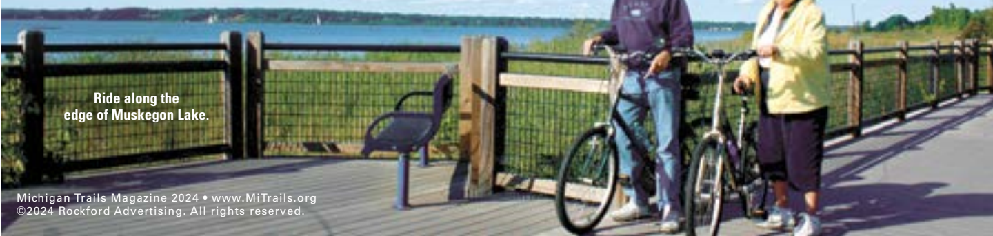
Ride along the edge of Muskegon Lake.

The 4-mile Laketon Trail links the Muskegon Lakeshore Trail to the Musketawa Trail. It was built on an abandoned rail bed that runs parallel to Laketon Avenue. A new section of the trail now connects to the Musketawa Trail through an industrial park. To connect with the Muskegon Lakeshore Trail, head west on Southern Avenue and north on Division Street.