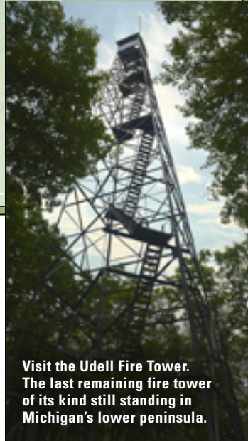
Visit the Udell Fire Tower. The last remaining fire tower of its kind still standing in Michigan's lower peninsula.