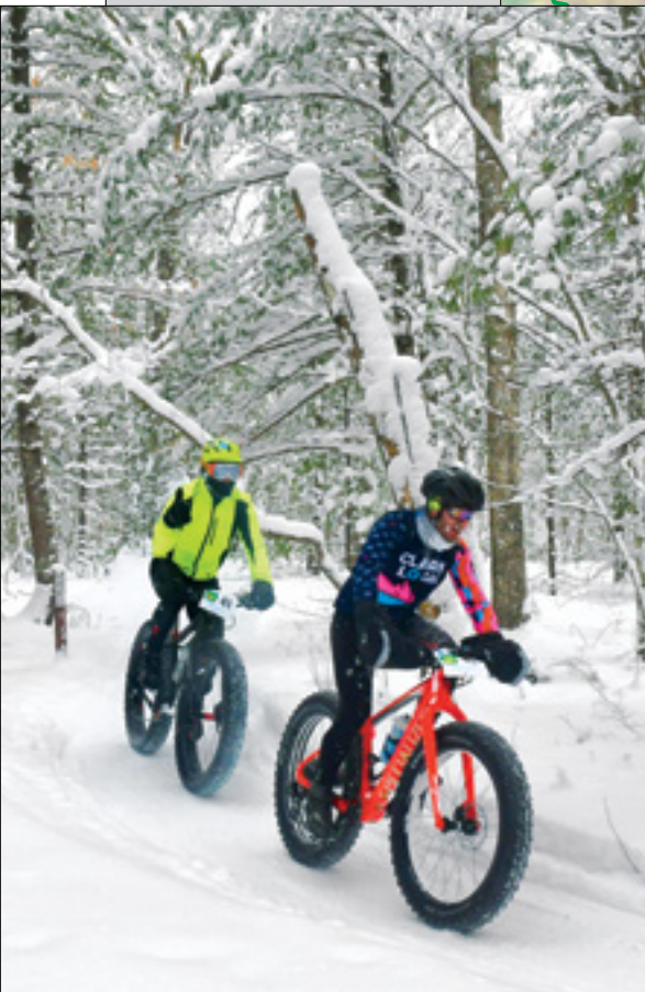
The Shoreline Cycling Club hosts the Big M Firetower Fat Bike Race in March.