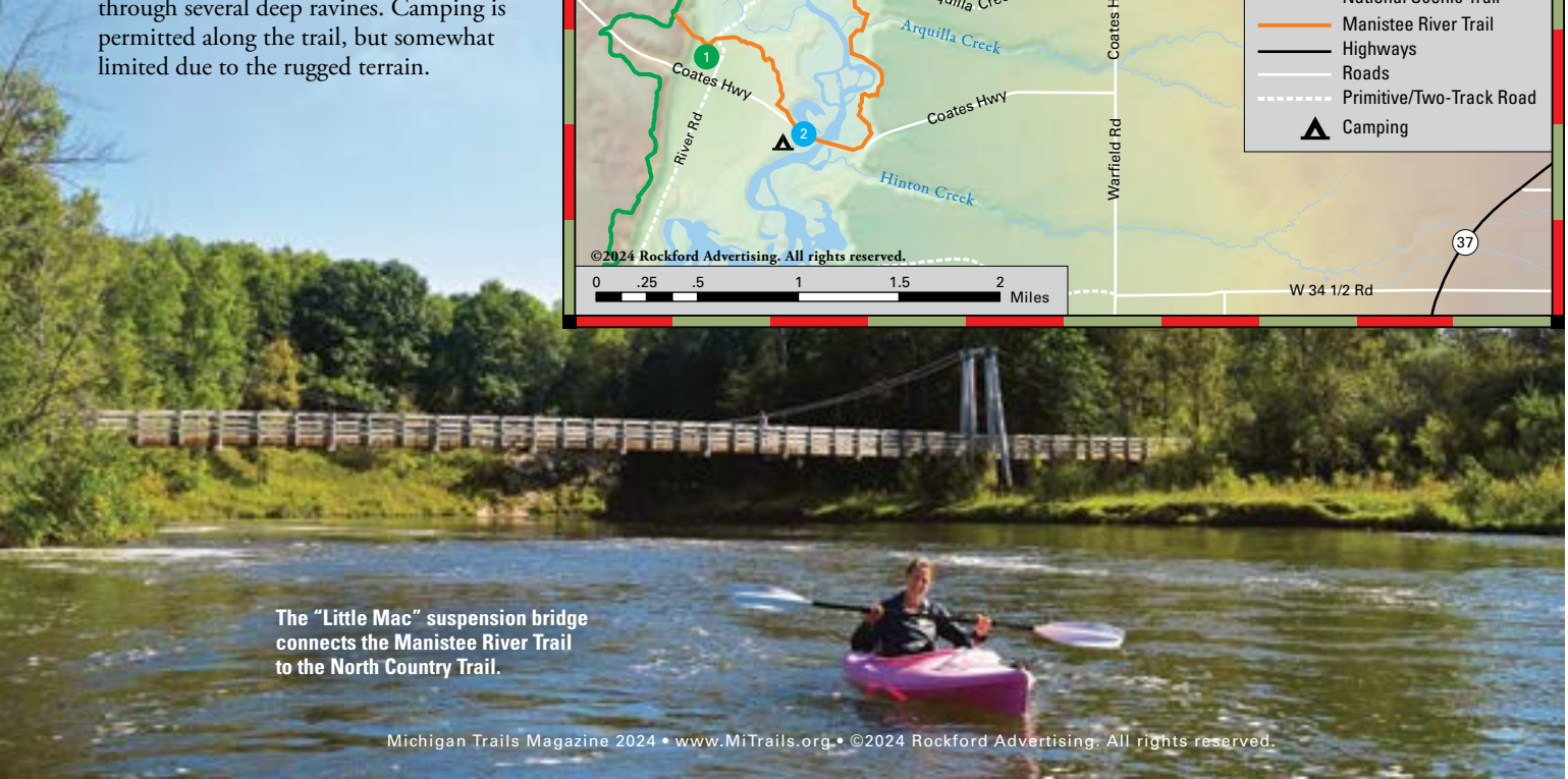
The "Little Mac" suspension bridge connects the Manistee River Trail to the North Country Trail.

Manistee River Hiking & Water Trail • North Country Trail