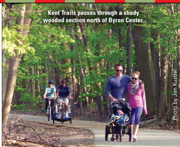
Kent Trails passes through a shady wooded section north of Byron Center.

Kent County's first paved rail trail, the 15-mile Kent Trails opened in 1992 linking John Ball Park in Grand Rapids to downtown Byron Center. This interconnected series of trails takes you across several bridges, through two tunnels (under I-196 and M-6) and along some very scenic stretches as you pass through several parks in urban, suburban and rural Kent County. The journey from the Millennium trailhead to Byron Center is a popular day trip. See page 81 for the northern section of Kent Trails.