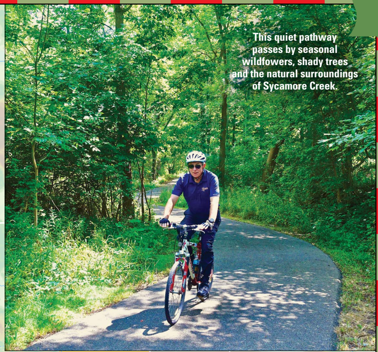
This quiet pathway passes by seasonal wildflowers, shady trees and the natural surroundings of Sycamore Creek.

0 .25 .5 1 Miles