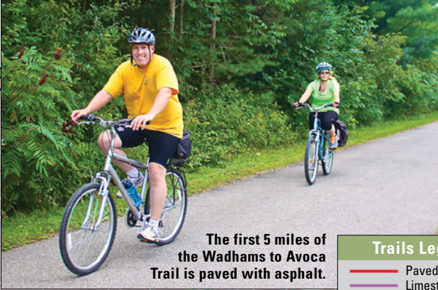
The first 5 miles of the Wadham's to Avoca Trail is paved with asphalt.