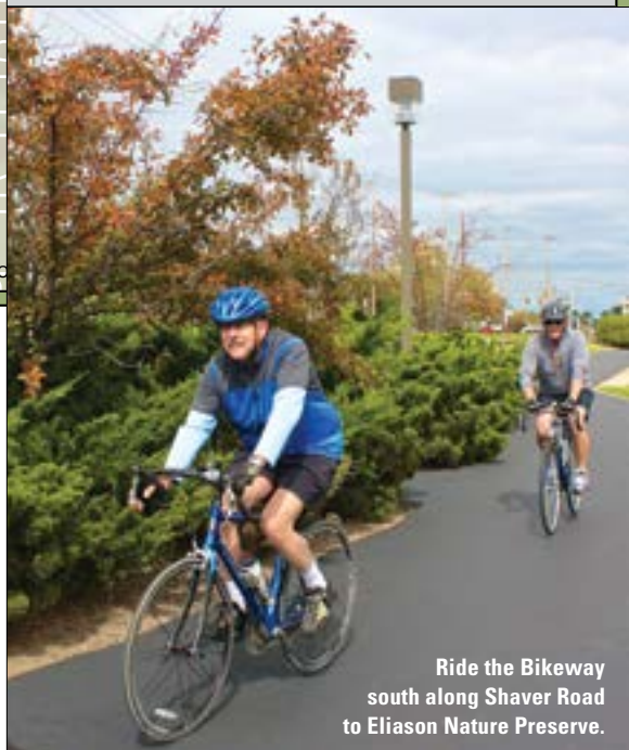
Ride the Bikeway south along Shaver Road to Eliason Nature Preserve.

In 2016, a new southern stretch of trail was opened, weaving its way through Eliason Nature Preserve. We saw whitetail deer and wild turkey in this wooded section. In 2020, another 1.1 miles of trail was added along Portage Road.